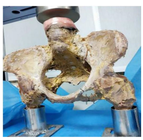
Fig. 3 Tile B fracture cadaver model, each left superior ramus and the inferior ramus of the pubis-ischium was sawed vertically