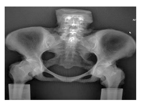
Fig. 2 X-ray image of a pelvic specimen reveals the absence of pathological malformations or pelvic fractures