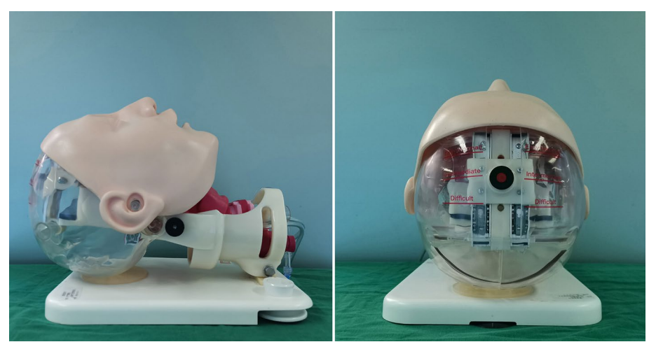
Fig. 1 Difficult airway management simulator

The structure of the flexible video laryngoscope (Fig. 2A–C): the FVL includes three parts: a display screen in the proximal part (1), a laryngoscope handle in the middle (6) and a distal insertion part. The handle is equipped with a control lever (7), a suction port (2) and a ventilation port (3). At the distal aspect of the insertion part is a bending section. (5), which is controlled by the control lever. A protrusion (4) is installed at the distal tip of the insertion part, and the movement direction of the protrusion is the same as that of the bending section. A guiding channel (8) is located on one side of the insertion part with a potential space on the channel wall. The FVL is also equipped with a stylet (9) and a guiding tube (10) (Fig. 2C). The guiding tube can be passed along the stylet (Fig. 2D), and the endotracheal tube (ETT) can be fixed outside the guiding tube (Fig. 2E). The stylet can pass the glottis through the guiding channel, and as the guiding