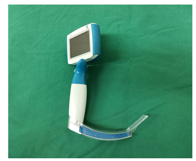
Fig. 4 Video laryngoscope

All participants were informed in detail about the characteristics of the flexible video laryngoscope and how to operate it before practice. Before measurement, each participant performed intubation twice using the FVL and a video laryngoscope (TDC-C3, Zhejiang UE Medical Corp, Xianju City, China; Fig. 4) in the neutral position with intermediate and difficult mouth opening, respectively. The study was conducted immediately after practice, and each intubation was conducted only once. Tooth loss, esophageal intubation, and attempts requiring more than 90 s were recorded as intubation failure [19]. Participants performed intubation in the difficult airway management simulator in the neutral position with intermediate mouth opening. Before the study began, the sequence of laryngoscope use (flexible video laryngoscope first or video laryngoscope first) was randomly allocated by a random number table (Randomization Adviser 1.0, Beijing, China). A reinforced tube (7.0 mm ID, Covidien IIc, Athlone, Ireland) was selected and shaped by the participant before video laryngoscope intubation. The guiding tube was also installed with the ETT in advance before FVL intubation.