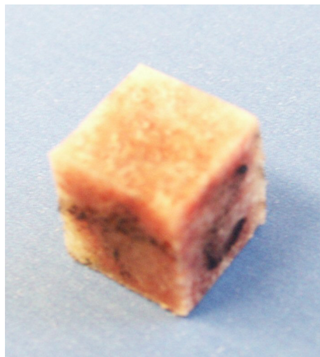
Figure 1 Cubic specimen cut from one canine femoral head.

For sonographic testing, a specially designed device with a custom-made ultrasound transducer (Institute of Materi-